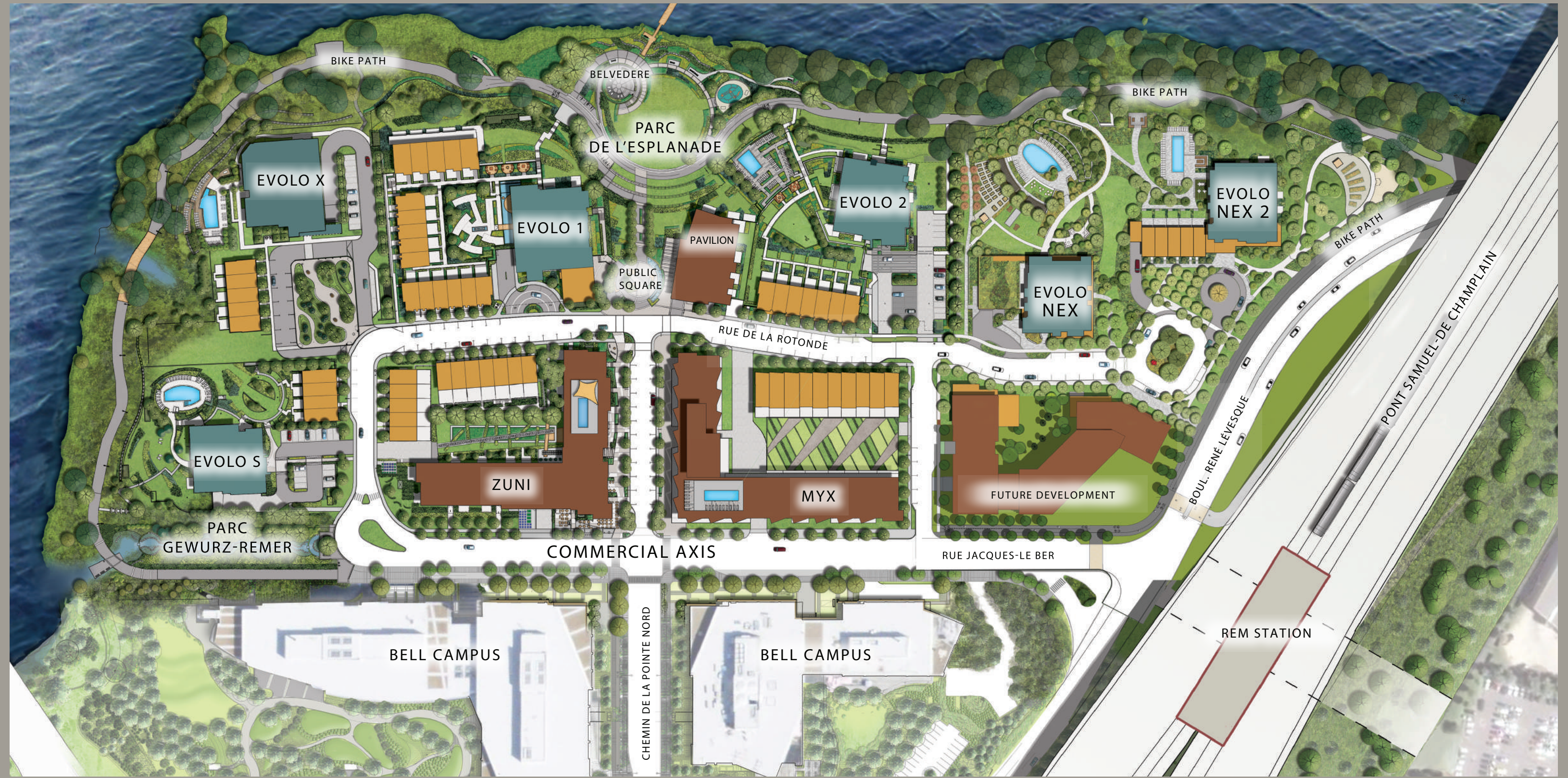
The position and shape of the buildings may vary